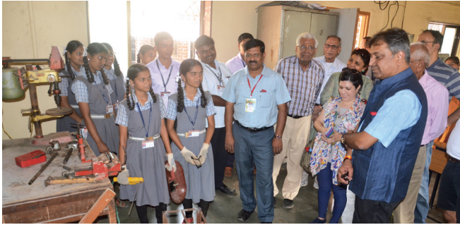
DG Prafull Sharma interacting with students