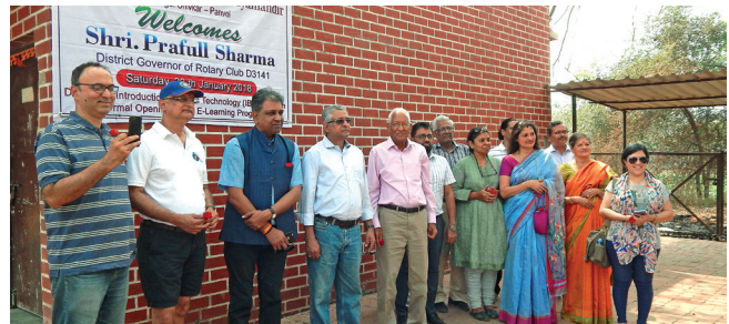
District dignitaries and Rotarians being welcomed by students of Rakesh Jain School in vill. Shivkar