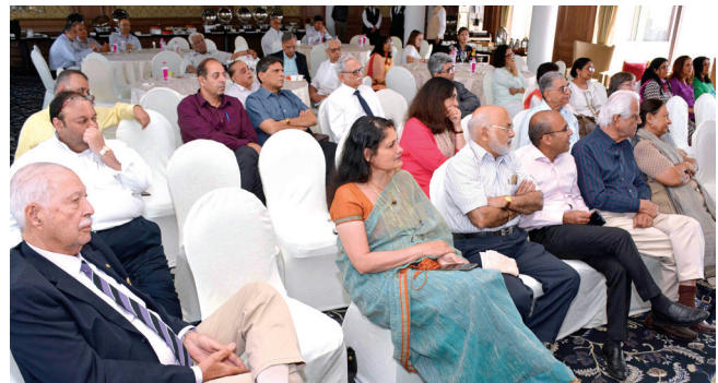
A rapt audience

On Wednesday, 21st February, our Club had the pleasure of having Nadir Godrej, the renowned industrialist and MD of Godrej India, in our midst in his avatar as a gifted poet. In beautiful stanzas he conveyed diplomatically his thoughts on various topics. Poetry being his main hobby; he likes to present lectures in the form of verse at various forums, to the enjoyment of his audience and also himself. He surely did regale our Club to a delightful poetic 'brainstorming.'