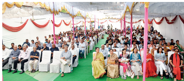
The size of audience only keeps increasing every year